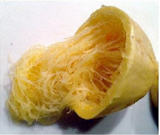
like strands of squash.