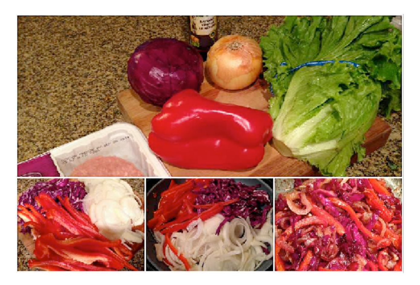
have cooked off).

• Add the garlic salt and balsamic vinegar and allow to simmer until the vinegar and veggies are shiny and caramelized. Stir often. (Most of the liquid will