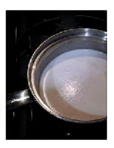
cup of the water until a thick paste is formed.